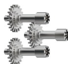
MPX mechanical key lock +3 cylinders