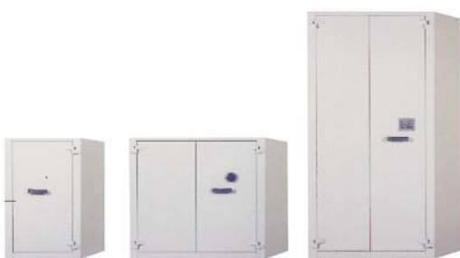
AF II security cabinets are available in three sizes

AF II cabinets are constructed using sheet steel for the body and double-panelled, 65mm-thick doors. The rounded door bolts are 20mm in diameter and protected by a relocking system which blocks the boltwork in the event of an attack.