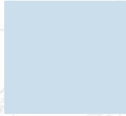
Interior fittings (from left): Shelf, lockable compartment